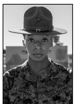
Drill Instructor Duty