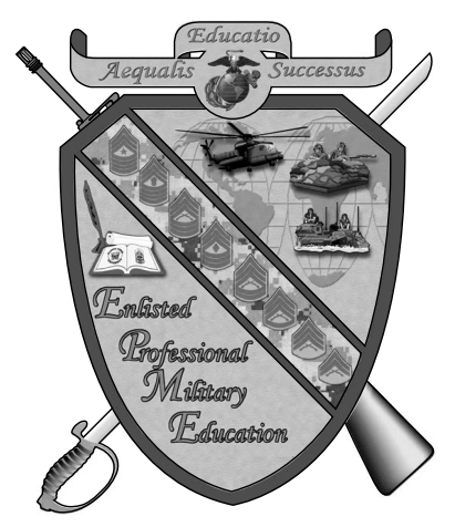
reminds Marines of Marine Corps Enlisted consequences to bad choices Professional Military Education Logo

Aside from the professional military education realm. additional annual training briefs are provided to remind personal Marines about resources available to them common behavioral pitfalls to avoid. Some of this instruction covers operational security, sexual assault prevention, suicide and prevention and awareness. Revisiting this information reminds Marines ofallows leadership and